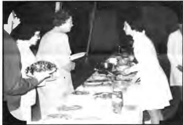
What a way to end a day of Fun-tivities, with a delicious pot luck dinner.