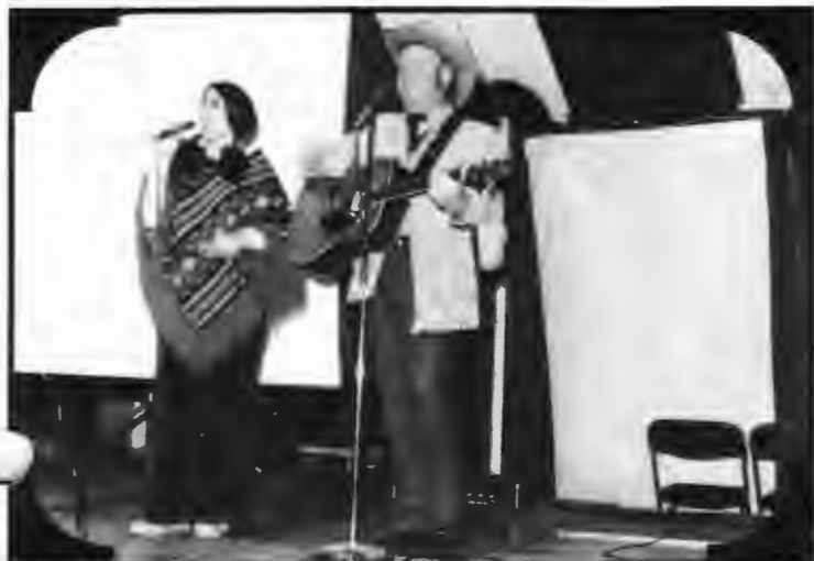
Bring on some lively entertainment . . .