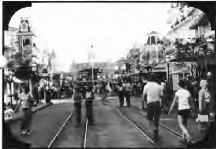
Throw in a tour of the famed Disney World Amusement Park . . .