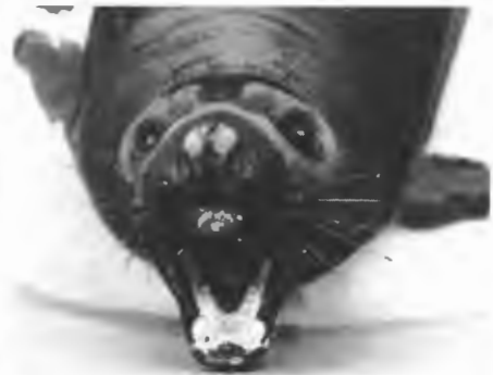
Well, almost everyone!