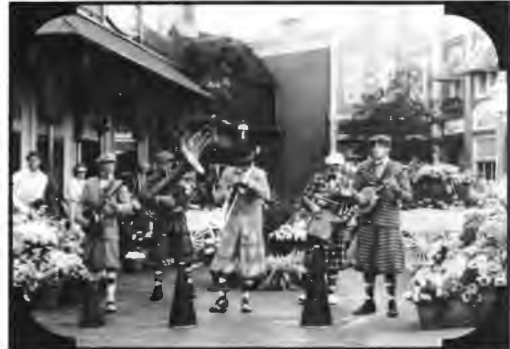
If you guys could just learn to march in formation, you'd be ready for half time at the Rose Bowl.