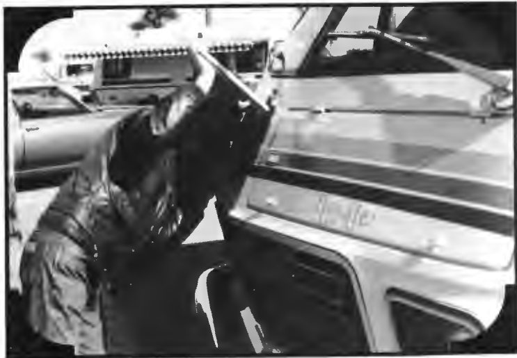
Well, that show is okay, but let's switch channels and see what's on the other stations.