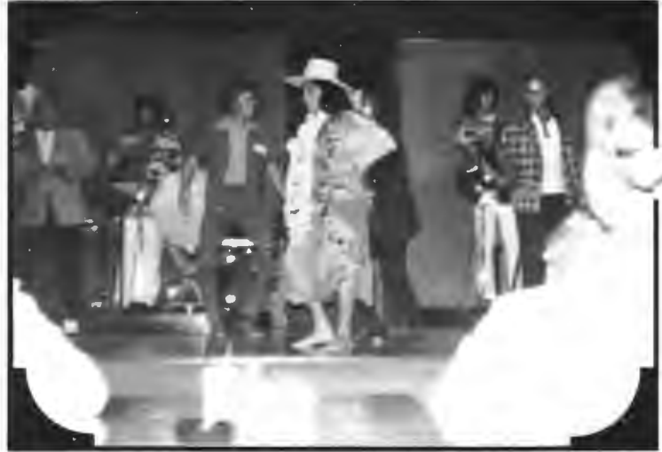
For some reason, it doesn't look the same when I do it.