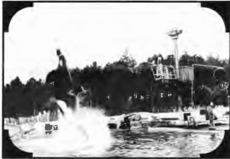
Add a flying killer whale . . .