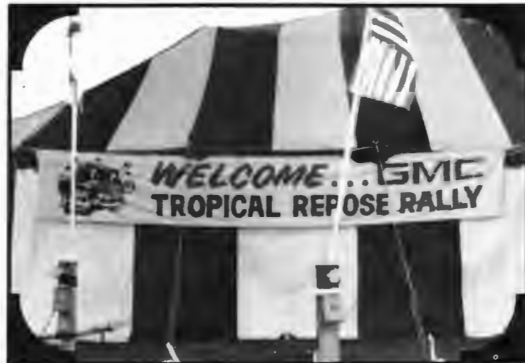
And what do you have? The GMC Tropical Repose Rally, a big Fun-tivities for all!