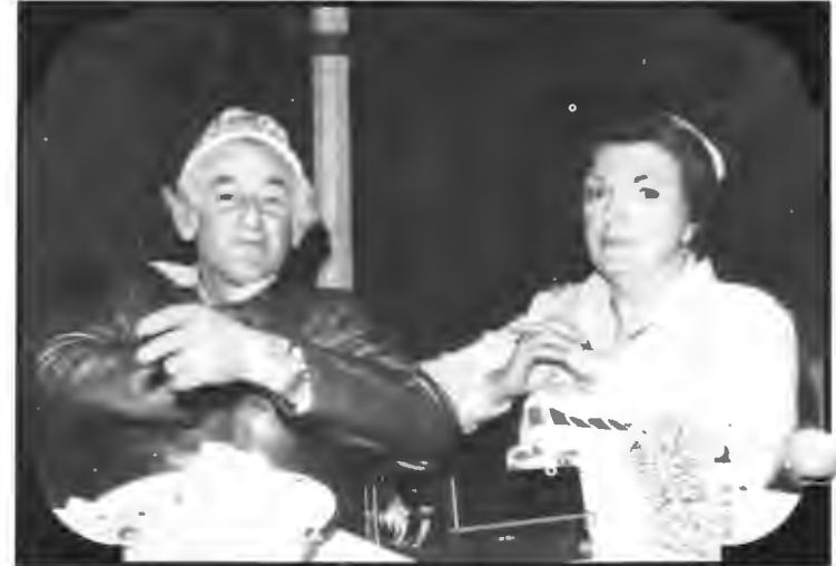
Ski hats in sunny Orlando? Why not?