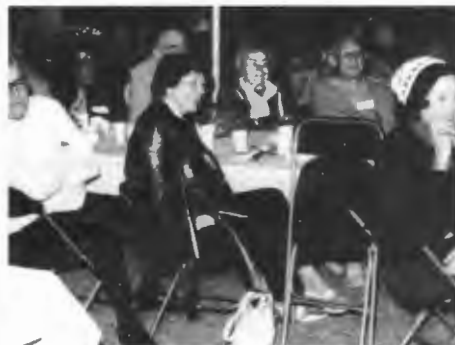
As you can see, everyone who attended our big GMC rally in Orlando had a roaring good time...