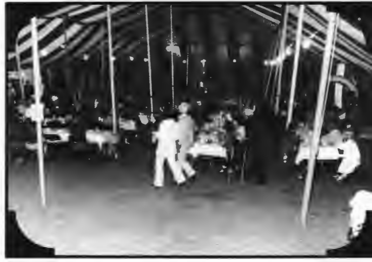
Put up a big "GMC Tent" and fill with a group of fun-loving owners . . .