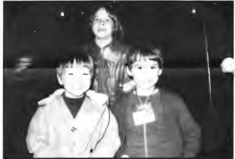
GMC rallies . . . not for adults only.