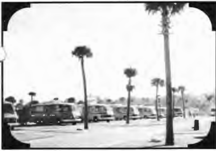
Take 125 GMC motorhomes parked side by side, add a palm tree or two and plenty of sunshine . . .