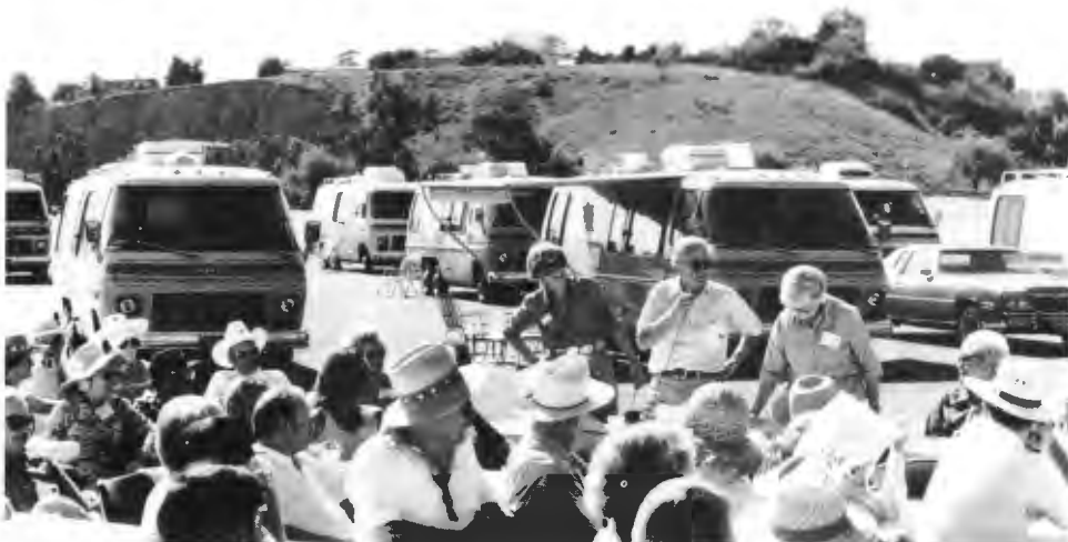
Saturday, November 6th, 38 GMC motorhome owners attended an organizational meeting at L.A.'s Dodger Stadium.

November is a time for giving thanks. And the GMC Elegant Cruisers, GMC Forty Niners, and GMC Northern Stars are thankful they have joined with other GMC motorhomers for the purpose of good old fashioned family fun.