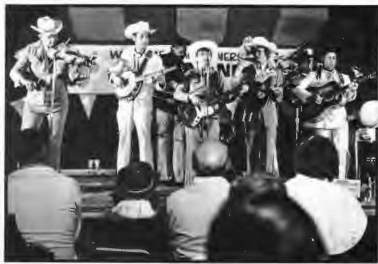
Thursday night Fun-Tivities include a champagne party with hors d'oeuvres and live country music by Lonnie Jones and the New Grass Express.