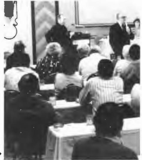
The Matterhorn Room at the Kings Island Inn, meeting place for the "Golden Harvest Organizational Rally."