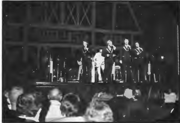
Saturday Fun-Tivities include a trip to Opryland and to the Grand Ole Opry, with a lively performance by the Four Guys.