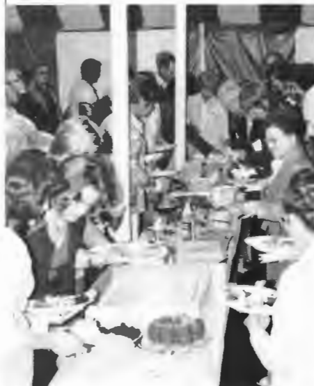
The meeting adjourns, and the owners, officers and guests meet under the tent for a delicious buffet.