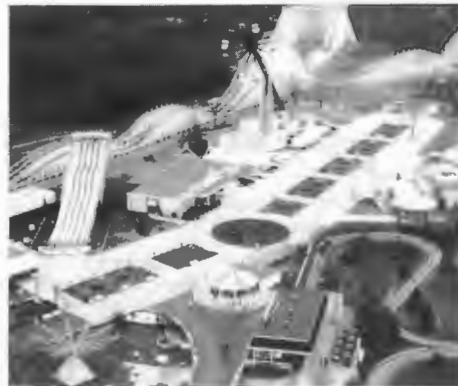
Aerial view of the popular Kings Island amusement area.

Stan Grueninger, Cincinnati GMC dealer, hosted the major rally and arranged festivities that included free passes to the Kings Island amusement area. Acles GMC, Dayton, and George Byers, Columbus, joined Grueninger in sponsoring a gourmet dinner Saturday evening at northern Cincinnati's shore bound Windjammer restaurant.