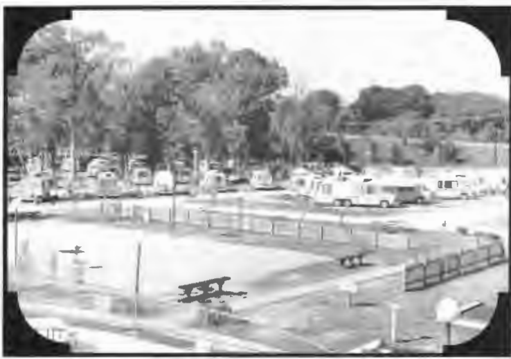
More than 200 GMC motorhome families roll into the KOA campground for the beginning of the first nationwide, all GMC rally in Nashville, Tennessee.