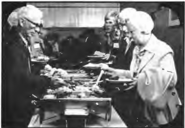
Friday Fun-Tivities begin at the lovely Silver Wings Restaurant with a Hillbilly Buffet that "stars" catfish, fried chicken, and, of course, black eyed peas.