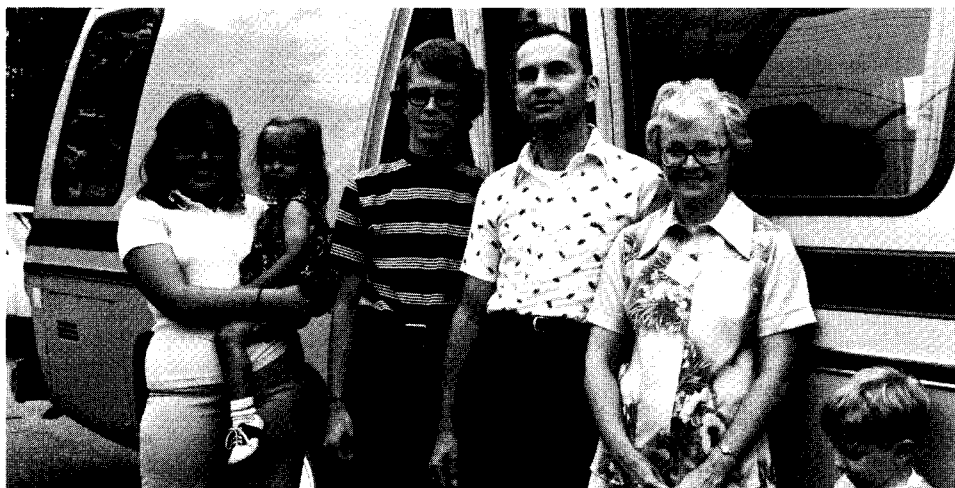
The Dubners (F-18122) visit GMC Headquarters