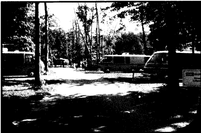
The Great Lakers form an impressive "GMC Motorhome Lane" at their September rally near Grass Lake, Michigan.