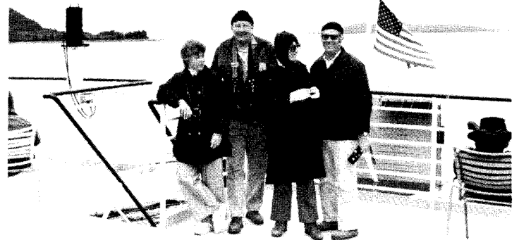
July 4th finds the expedition aboard the M. V. Bartlett as it passes the famed Columbia Glacier (the white break in coastline).

From Haines, the expedition encountered two more interesting