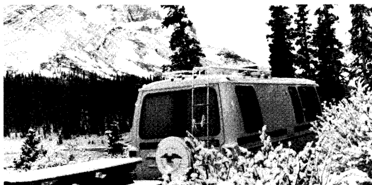
A few miles down the road, 2,200 to be exact, the group encounters high country and their first snow.

variations in their mode of travel before reaching Anchorage and Mt. McKinley National Park. The first, another boat excursion found the GMC explorers on the M. V. Bartlett for the 100-mile trip from Prince William Sound to Whittier, where they drove onto a train for the ten mile rail trip to Portage, Alaska. Following Portage, the expedition hit solid ground again and they had clear motorhoming all the way to Anchorage and Mt. McKinley, a most beautiful spot in which to conclude the Church and Trost Bi-Centennial Expedition to Alaska on July 10, 1976.