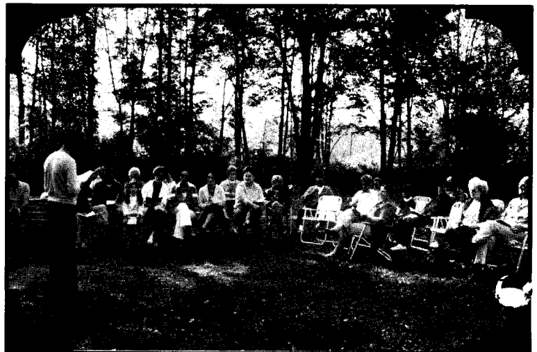
The Great Lakers September rally closed on a thankful note as George Schipper delivered Sunday service.