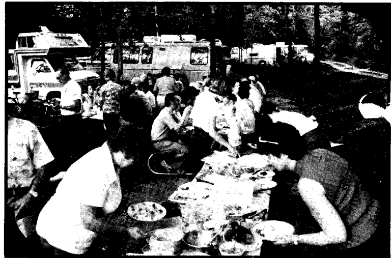
There was an excellent turn out at Grass Lake as indicated in this mouth-watering dinner scene.