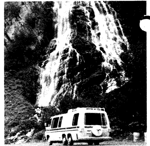
The expedition pauses near a breathtaking cascade outside of Valdez, Alaska.