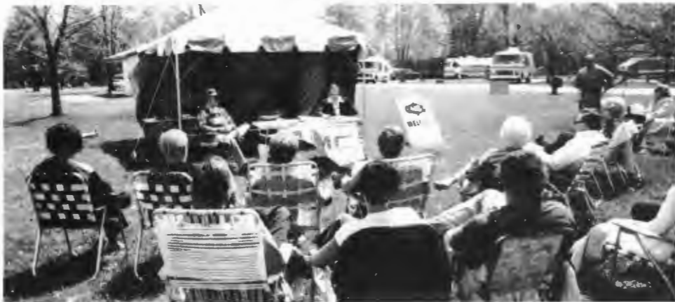
Harvey Lawrence conducts seminar for GMC Country Club members on picturesque trails, boating and fishing.

Other activities at the park included golf on the exciting 9 hole championship course, nature hikes