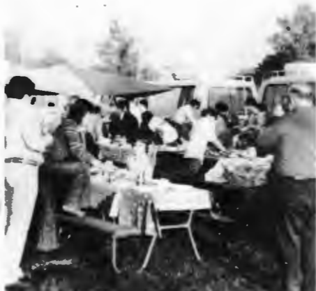
Talented Six Wheelers brought beautiful hand-made items for the craft auction.

Saturday morning found coffee brewing under their new tarp do-